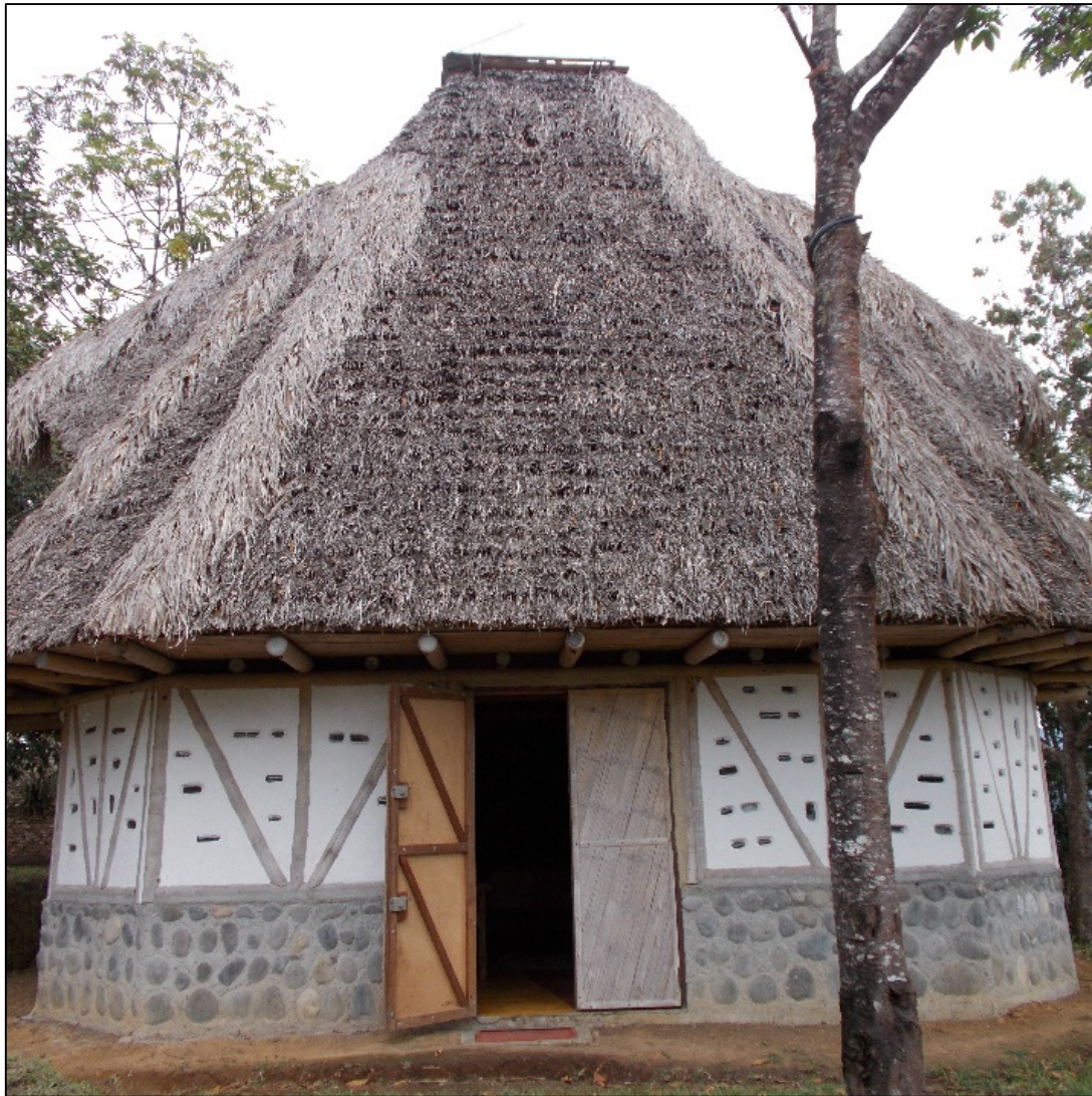
Figure 2: A casa de semillas

An exception: intracommunity loans. The three tactics just described are common to all regions where Red de Semillas works. In one region, however, traditional communities have also implemented the creation of intracommunity loans. These community funds enable community members to develop cropping projects without being forced to use private seeds. Each of the members of the communities that participate in the project contribute a small amount of money every month to a collective saving. When one of them has the opportunity to commercialise seeds/harvest, the savings are made available to that person without predatory lending.