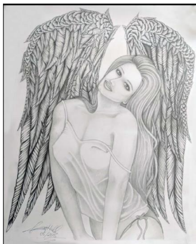
Figure 4: Graphite drawing by JH (2018: 10)

Volume 84 features JH’s (2018) graphite drawing of a woman sitting seductively in a translucent shirt and underwear with long feathered wings flowing from her back (see Figure 4). JH’s soft and inviting angel contrasts with the starker, more intense images of skulls and devils that are common to Cell Count’s pages.