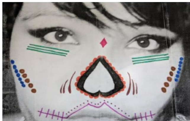
Figure 3: Photograph by MEY (2018: 7)

A black-and-white photograph from volume 84 features a woman with sweeping side bangs and cat-eye makeup. The artist, MEY (2018), overlays the photograph with drawings in colored markers to transform the face into a Cinco de Mayo mask that includes a black silhouette with red ruffles over the nose, blue lines