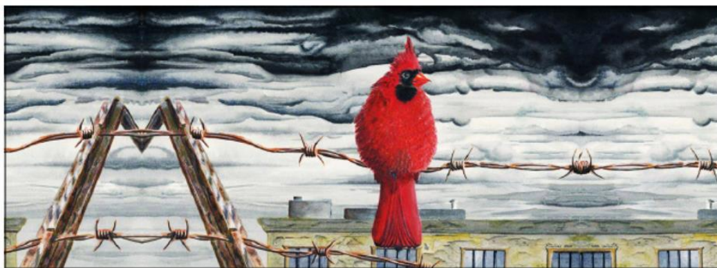
Figure 5: Drawing by PC (2015: 8)

These artists' views resemble Motyl and Arghavan's (2018) observations of Abu Ghraib detainees who wrote poetry that the "very act of continuing to write ... constitutes a performative survival of neocolonial necropolitics" (129). Art is a kind of survival strategy, an act of resistance that breathes life into the interiority of subjects otherwise deemed dead. Prison culture itself might engender a death-world with its own internal rules of order, and might embrace processes of abandonment and injury, but art can reveal that subjugated groups are not wholly defined by their subjugation. Indeed, as Cheliotis (2014) notes, "even — or perhaps especially — in such oppressive environments as prisons, the exercise of power is always bound to meet with some degree of resistance" (18). Fanon (1963) references this relationship, stating, "The first thing the colonial subject learns is to remain in his place and not overstep its limits. Hence the dreams of the colonial subject are muscular dreams, dreams of action, dreams of aggressive vitality" (15). For Fanon the vibrancy and vitality of dreams provide a kind of freedom in a context in which authorities work to enact total domination.